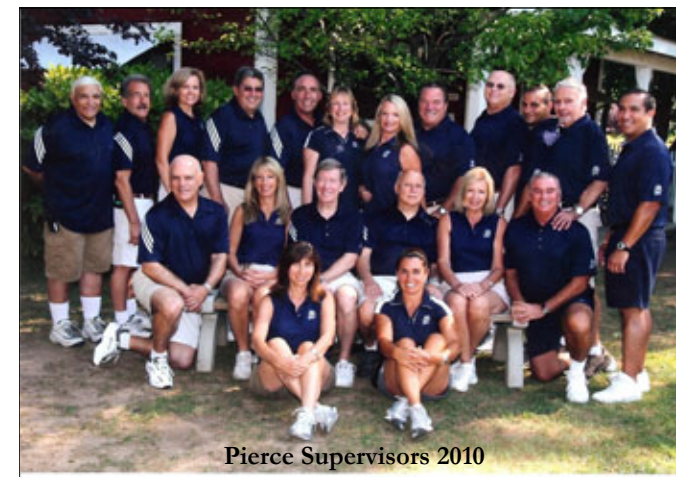
Pierce Supervisors 2010