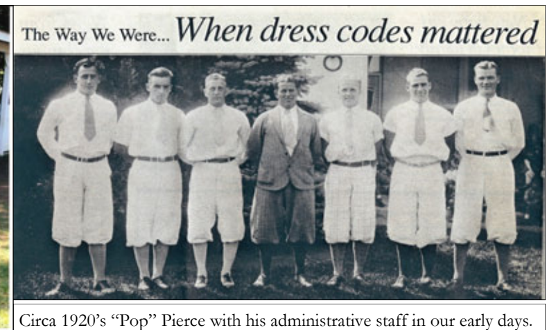
The Way We Were... When dress codes mattered