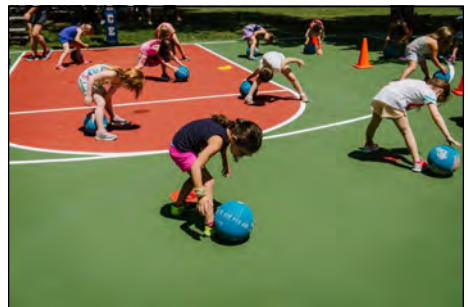
Baskefball skill clinics