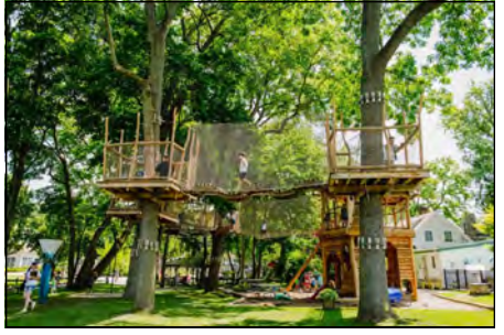
Tree-mendous Aerial Playground