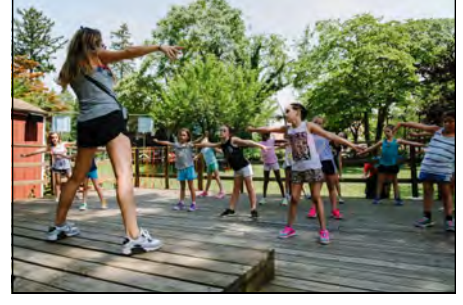
YAZ - Yoga Aerobics & Zumba on the deck