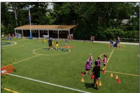
our beaufiful furf field