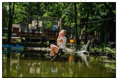
Sky-fly zip line over the pond