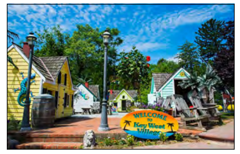
our key west Play Village