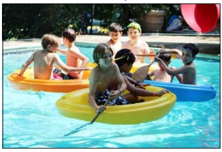
Boat races in the pool