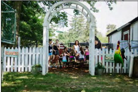
our New Nature area ...